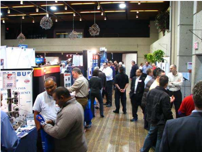
ISA Hamilton Exposition, March 2011.